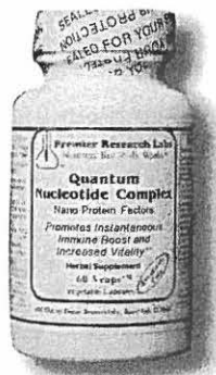
Quantum Nucleotide Complex (60 Vcaps)

800-325-7734 • fax 512-341-3931 www.prlabs.com • info@prlabs.com